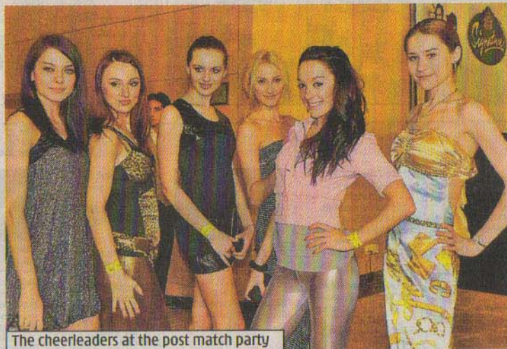
The cheerleaders at the post match party